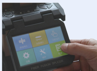
Graphical interfaces and touch screen