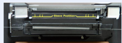
Intelligent heat shrink